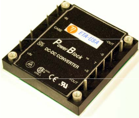
Size: 60.70mm x 57.91mm x 13.30mm (2.39in. x 2.28in. x 0.52in.)