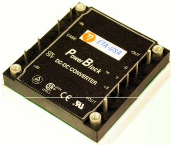
Size: 60.70mm x 57.91mm x 13.30mm (2.39in. x 2.28in. x 0.52in.)